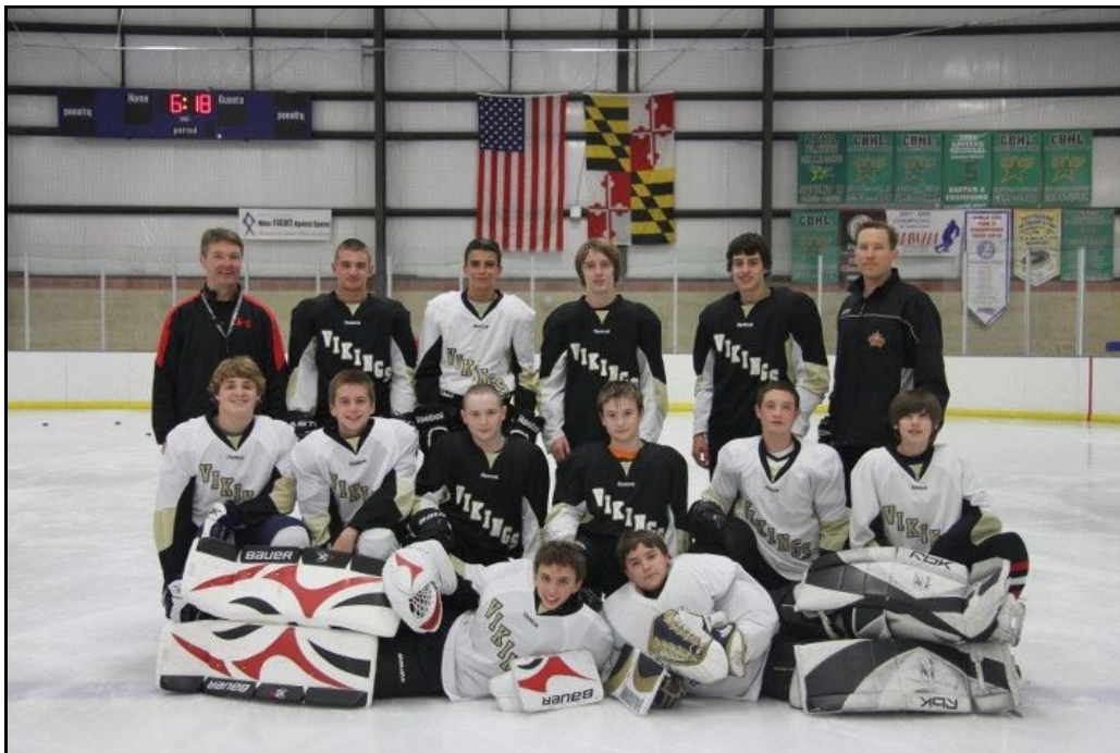
2011-2012 Mt. Hebron Ice Hockey Team